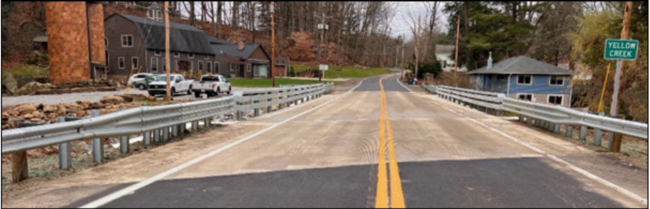
Granger Road over Yellow Creek (BAT-079-0221 )