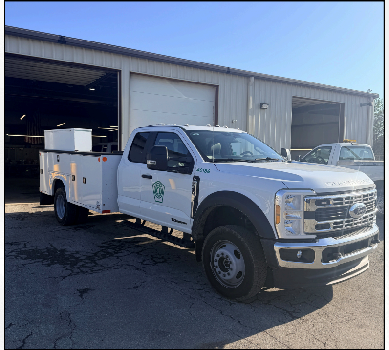
The new Ford F550 Fuel Transport Truck

In addition to the above specific projects, guardrail repairs, signage installation, mailbox repairs, bridge repairs, roadside ditching, culvert cleaning, berm cutting, pavement repairs, tree trimming, lane striping, and weed control were also performed throughout Summit County by the North and South District.