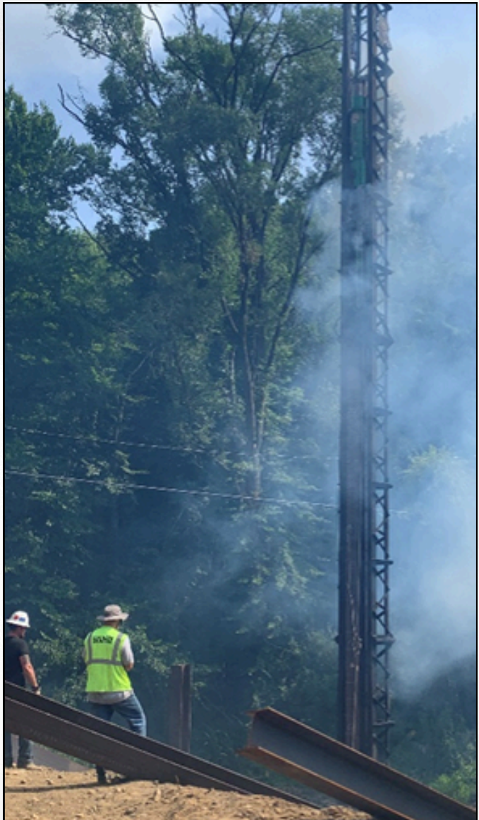
Bridge No. BAT-079-0221 Granger Road over Yellow Creek. SCE inspection of pile driving operations at rear (west) abutment.