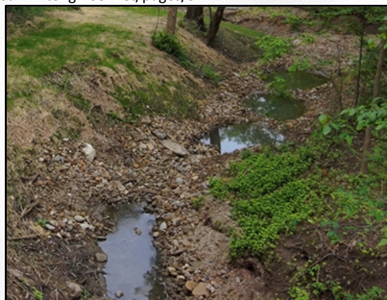
Wye Rd In-Stream Step Pools

SWMD's background, highlights, news, reports, rules, regulations, forms and more can be found on the internet at: www.summitengineer.net/pages/SWMD