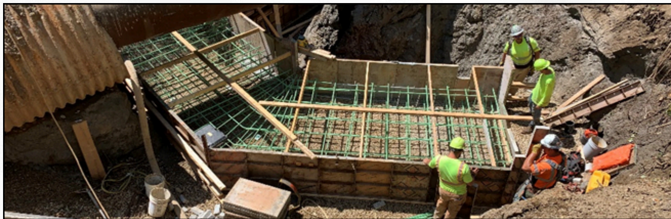
N. Revere Road over Revere Run (BAT-114-0320)