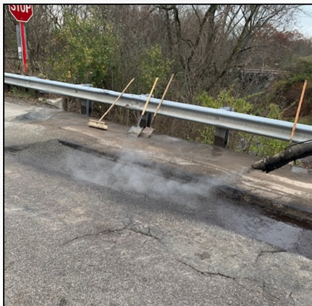
Hudson Run Road over Wolf Creek - BAR-007-0142