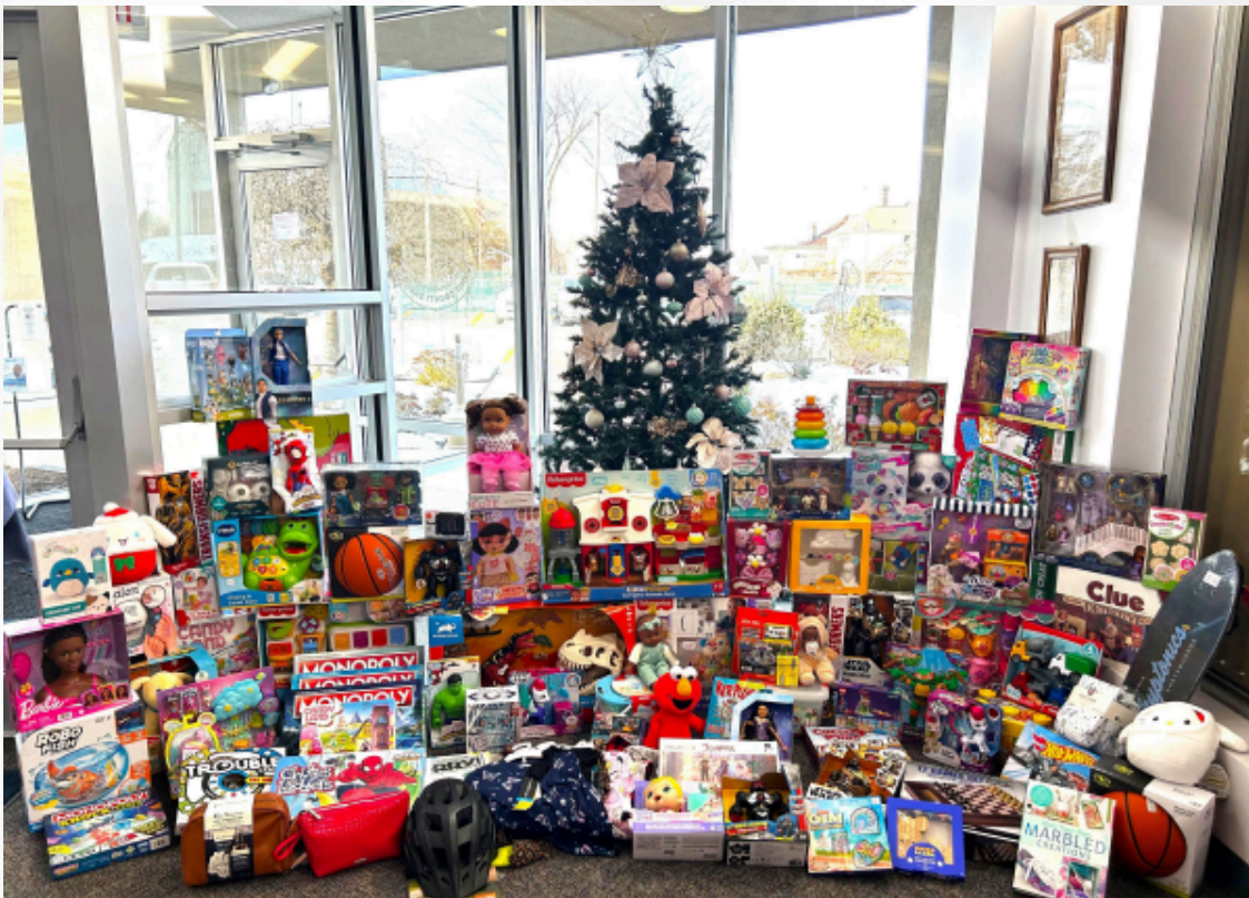
Holiday Gift Donations displayed in the Summit County Engineer main office lobby.

As the office looks ahead to the coming year, initiatives like this continue to highlight the role of public service, not only in maintaining infrastructure, but in strengthening the community as a whole.