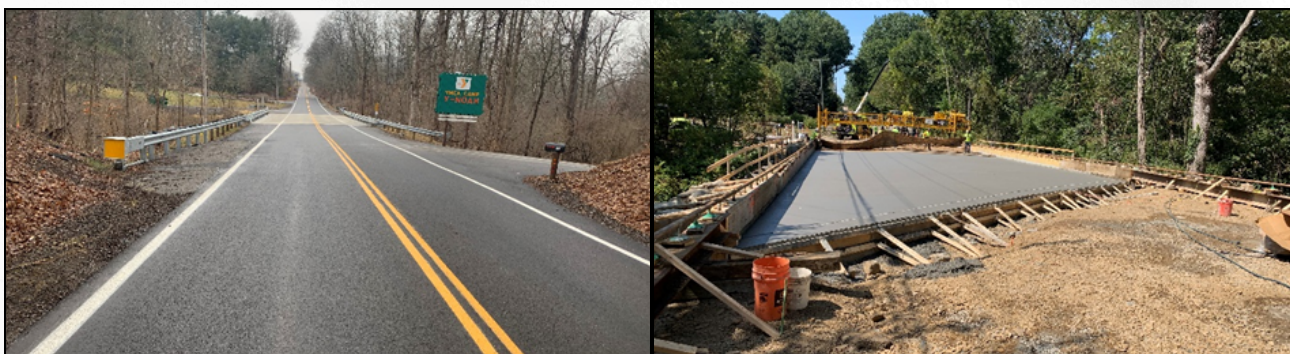
Mt. Pleasant Road Over Nimisila Creek (GRT-007-150)

The Summit County Engineer's office, in partnership with The County Engineer's Association of Ohio (CEAO) completed bridge load ratings for 110 of our bridges 149 NBI Bridges (Bridges over 20 feet in length) using two Task Order Consultants. Results of the Load Ratings determined an additional 5 bridges required Weight Limit Restrictions. Load Posting Signs were installed at each of these bridges in accordance with FHWA/ODOT policy. Summit County currently has imposed Weight Limit Restrictions on 15 of the 279 bridges (5%).