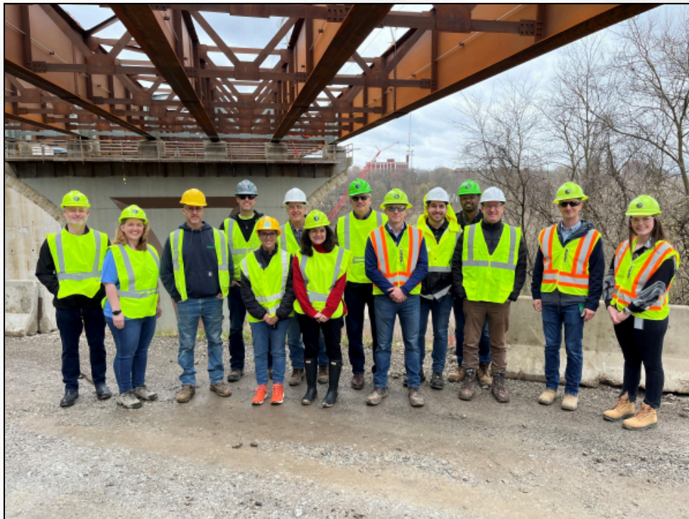
Representatives meet under the newly set Rt 8 Bridge superstructure

The visit also highlighted the importance of coordination between agencies and elected officials when addressing large-scale infrastructure projects. As planning continues for the High-Level Bridge, collaboration and shared knowledge will play an important role in ensuring a smooth and successful process.