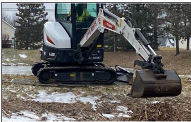
Sediment Removal at SWMF

Owners of lots within most township subdivisions developed since the mid-1980s pay Drainage Maintenance Assessments along with their real estate taxes. This funding pays for routine inspection & maintenance and necessary repairs of the stormwater management facilities (SWMF) within those assessed subdivisions with known drainage issues. In 2025 Davey Resource Group and Emerald Environmental continued their programs at 72 SWMFs for invasive vegetation control and biomass removal at stormwater management facilities.