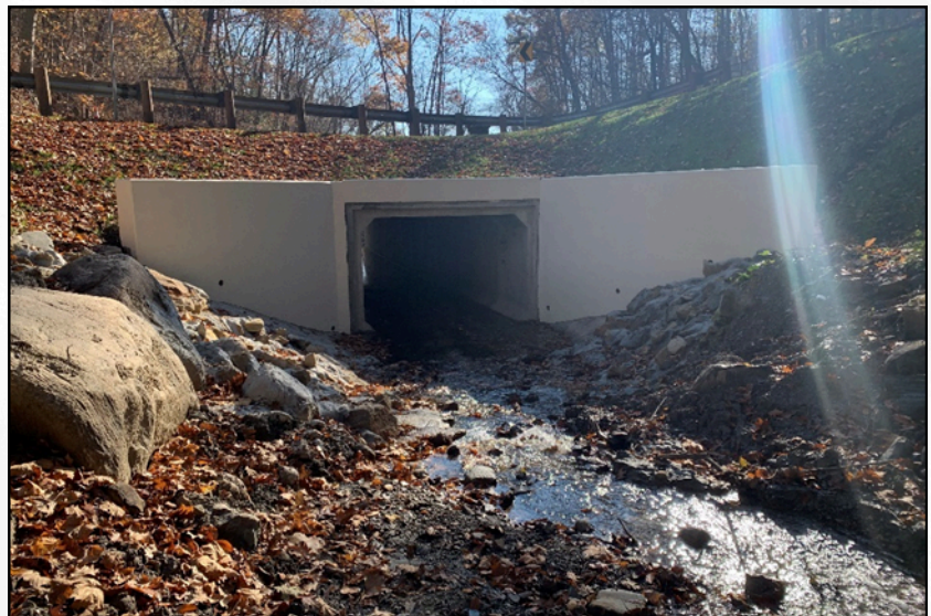
Bridge No. BAT-114-0320 N. Revere Road over Revere Run includes a new concrete box culvert structure, looking at the inlet end of structure.