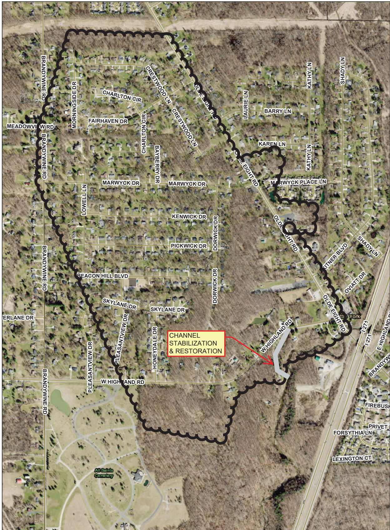
Figure 1-APPROXIMATE WATERSHED AREA