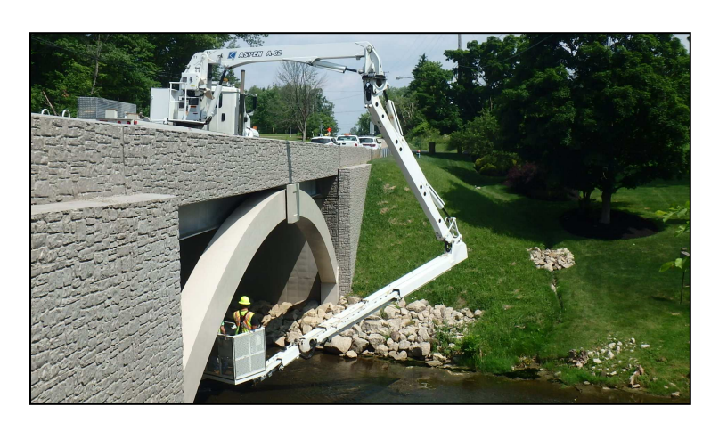
Ravenna Road Bridge over Tinker's Creek—Snooper Truck Inspection

312 total bridges 117 in Townships 195 in Cities and Villages