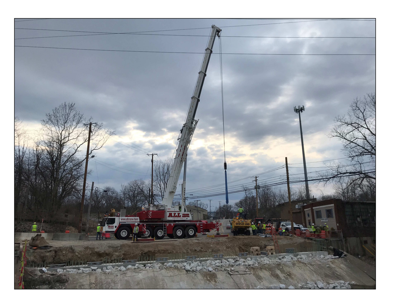
Home Avenue Bridge Replacement—to be completed in 2019