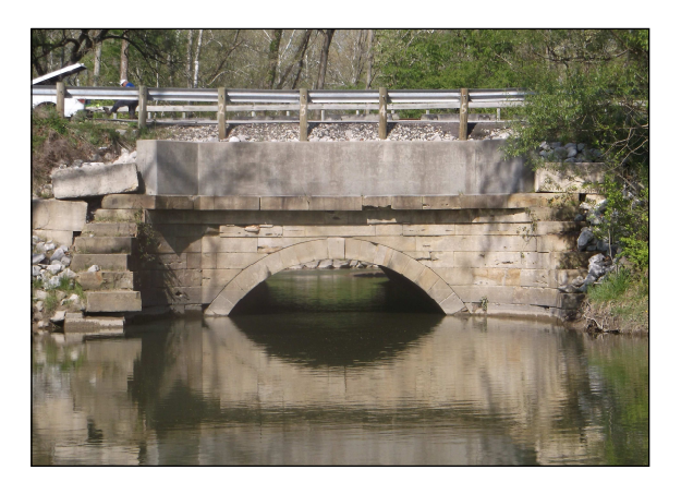
Riverview Road Stone Arch Bridge

This project made repairs to the North Main Street structure crossing over the Cuyahoga River, also known as the High Level Bridge, including patching the bridge deck wearing surface, epoxy waterproofing overlay repairs, catwalk railing repairs, and truss gusset plate steel repairs. Becdir Construction was the contractor for this $453,761.25 project.