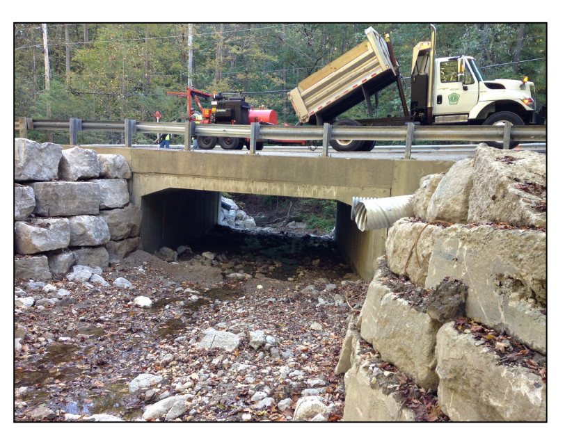
Martin Road Bridge—Erosion Control Project

District 1 $234,839.29 District 2 $127,723.31 Total $362,532.60